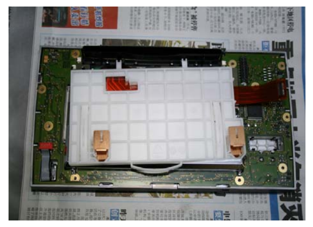
Step 4: Take apart the white plastic board.