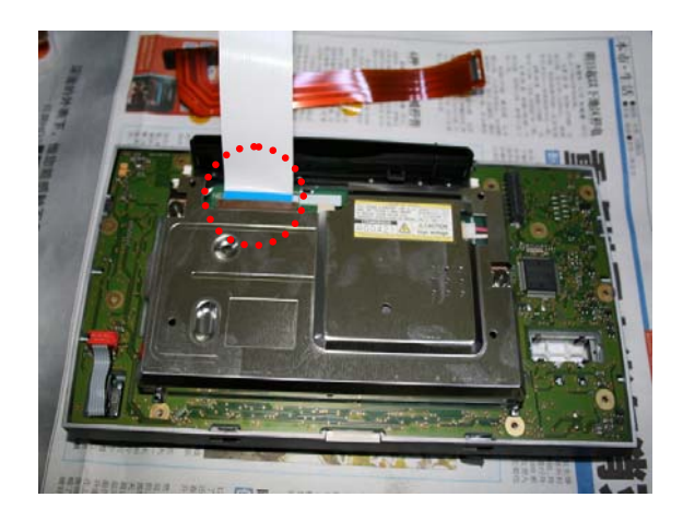
Step 6 : Connect the offered FFC cable to the connect where the brown FPC cable is connected.