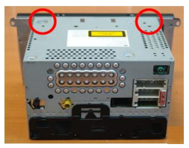
Step 1: Take apart the screws marked with the tools.