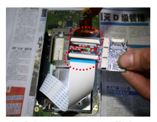
Step 7: Connect each opposite side of FFC, Brown cable to the daughter board like the above picture.