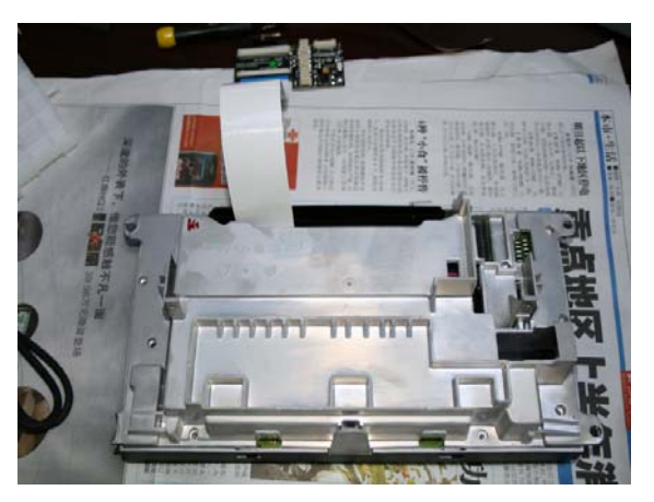
Step 8: Assemble the silver steel case back