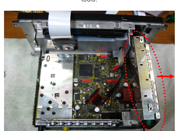
Step 3 : Separate the marked board like the above picture.