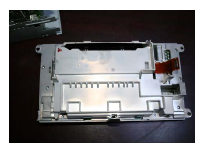
Step 3 : Separate the marked board like the above picture.