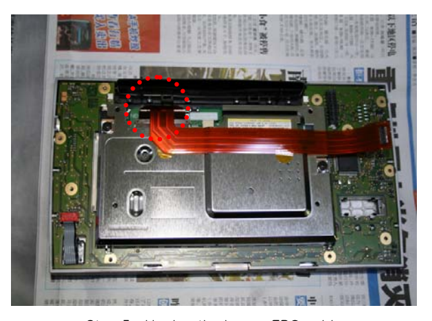
Step 5 : Unplug the brown FPC cable