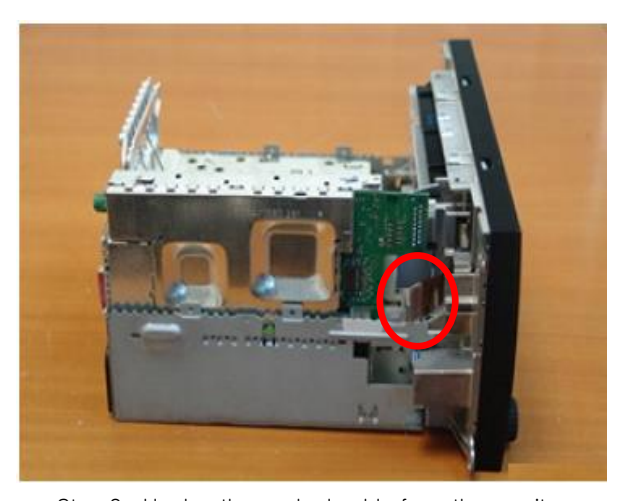
Step 2: Unplug the marked cable from the monitor